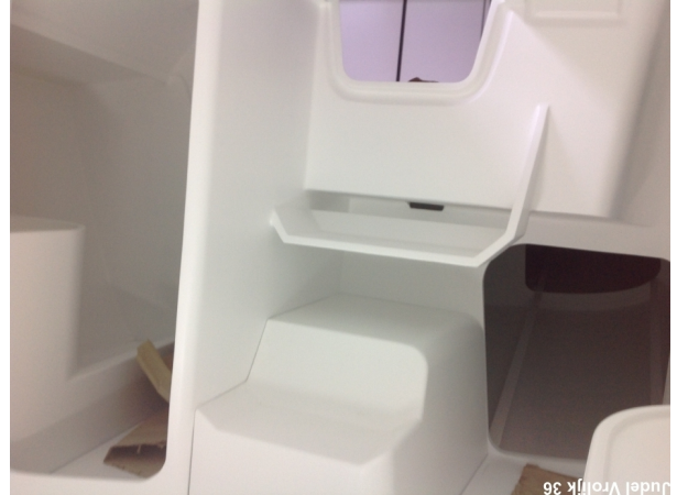
Model Vrolijk 36