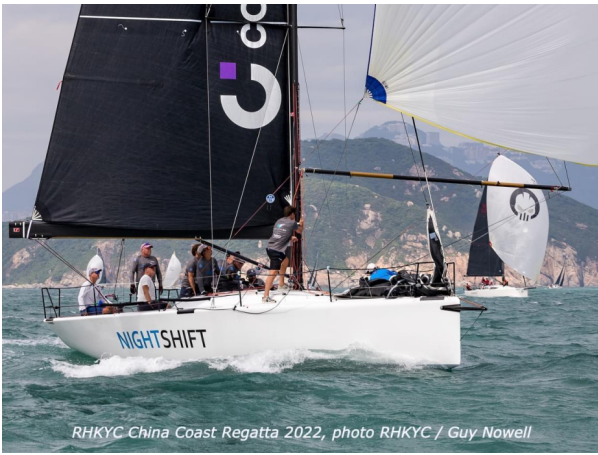
RHKYC China Coast Regatta 2022, photo RHKYC / Guy Nowell